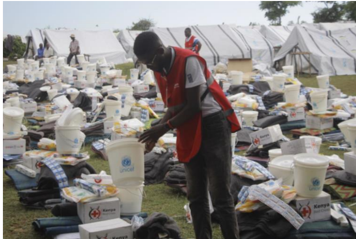
Distribution of Non-Food items to flood-displaced households in partnership with Kenya Red Cross in Nyakach, Kisumu County @2024/kenyaredcross