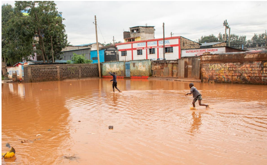
Children playing at the flooded entrance of Mcedo Beijing School at the Mathare informal settlement in Nairobi County