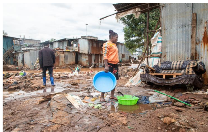
A woman collects water from a damaged pipeline at the Mathare informal settlement in Nairobi County