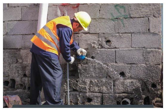
An engineer is testing the water meter to provide clean water for people in Al Hudaydah city.

More than 2 million people (30 per cent of annual target) were provided with safe drinking water in 15 major cities and rural communities in Al Bayda, Al Hudaydah, Amanat Al Asimah, Amran, Dhamar, and Sa'ada. UNICEF supported the operation and maintenance of the water supply systems, through the provision of fuel, electricity, spare parts, alternative energy options and disinfectants for bulk and water tanks chlorination. While UNICEF reached 2 million people (30 per cent of annual target) with safe drinking water in January alone, the same beneficiaries will be supported to access safe water in the coming months. In addition, 1.9 million people in Al Hudaydah and Amanat Al Asimah also benefitted from the waste water treatment plant operation and solid waste management.