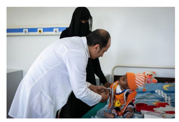
A boy is being treated for malnutrition at a hospital in Sana'a.

In January, 50,322 children under one received the third doses of Penta. 44,135 children under one (6 per cent of annual target) received the first doses of Measles Containing Vaccines (MCV1), and 28,650 children above one received second doses of MCV1. 35,824 women of childbearing age were vaccinated with Tetanus vaccine through the routine Expanded Programme on Immunization services provided by fix,