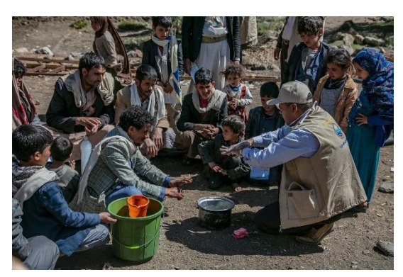
A community in Sana'a learns how to handwash and keep their water supplies clean and safe from cholera, by a Rapid Response Team.

UNICEF supported 355 Oral Rehydration Centres (ORCs) and 70 Diarrhoea Treatment Centres (DTCs) in 201 districts in 18 governorates. In January, over 9,000 AWD/cholera suspected cases were treated in those ORCs and DTCs. This represents a quarter of the national caseload (35,628). To strengthen the health system, increase more accessibility for the affected population and ensure the sustainability of the services, UNICEF integrated ORCs to the primary health care centres. For the preparedness of any