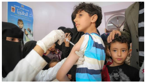
Children are receiving diphtheria vaccination during the Diphtheria outreach activities in Dhamar city.

Diphtheria (Td) vaccine. Td vaccine will protect the women and newborn babies from Tetanus and Diphtheria. The campaign is ongoing until 4 October, and the data of reached beneficiaries will be reported in October. The first round of MNT vaccination campaign is followed by a second and third round of the campaign after one and six months respectively. The vaccination campaign is being accompanied with social mobilization and awareness campaign.