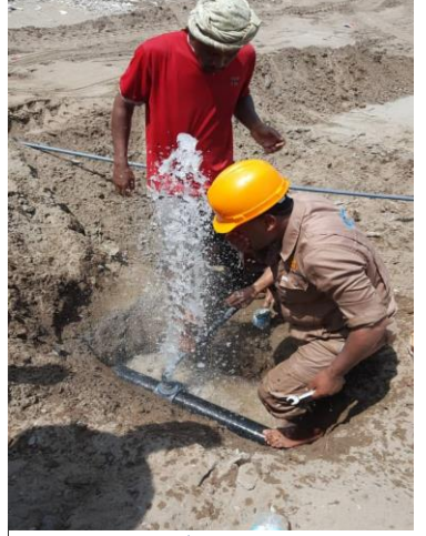
QIPs in Al Hali district in Al Hudaydah governorate.

The boundaries and names shown and the designations used on this map do not imply official endorsement or acceptance by the United Nations. Data source: GoY/CSO/EWARS/UNICEF team