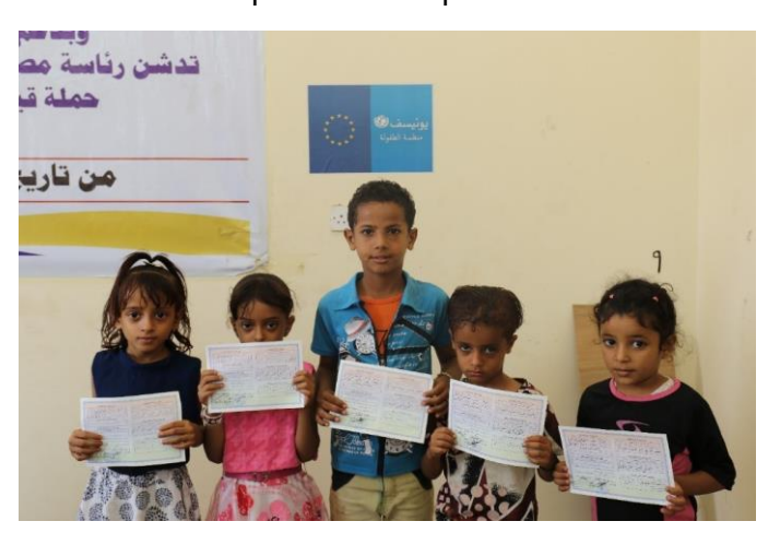
A group of children from Taiz holding their long-awaited birth certificates, allowing them to finally have access to one of their fundamental rights.

Between January and December 2018, the Country Task Force on Monitoring and Reporting verified 1,321 incidents of grave violations against children. The escalation of hostilities in Al Hudaydah governorate resulted in a dramatic increase of children killed and injured because of the conflict. Specifically, data increased from around 100 child casualties in 2017 to over 500 child casualties in 2018. The verification of recruitment and use of children decreased by 60 per cent in 2018 compared to 2017 due to security threats and access constraints on humanitarian actors and human rights monitors. Education and health related incidents increased by 56 per cent compared to the previous year; 46 per cent of the education and health related incidents were attacks on schools and hospitals and 44 per cent were the military use of schools and hospitals.