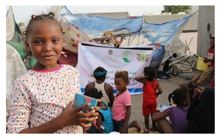
UNICEF raises awareness of the displaced communities on the importance for all children to have access to education through C4D approaches in Al-Farsi

In 2018, the planned target of 6,000,000 affected people to be reached through integrated emergency and outbreaks C4D response was surpassed reaching more than 10 million people (1,490,540 boys; 1,578,431 girls; 3,788,822 men; 3,809,813 women). This included at least 200,000 marginalized people such as the Muhammaseen, who are amongst the most deprived, vulnerable and internally displaced communities. The overall target was exceeded due to the extensive awareness activities associated with eight rounds of national and sub national vaccinations campaigns, including Polio, Measles and Diphtheria, Oral Cholera Vaccination.