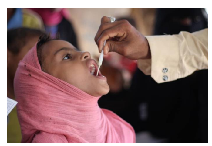
A girl taking her vaccine dose during the Oral Cholera Vaccination campaign conducted in Al-Mrawa'a district of Aden

To contribute to a better health outcome for children, foster female empowerment and in an effort to bridge the gender gap, a Community Health Workers network was launched in 8 governorates and 28 districts, including Sana'a, Sa'ada, Hajjah, Ibb, Hodeida, Lahj, Abyan, Hadramout. In 2019, this will be scaled up to 11 Governorates, including 65 districts: Sana'a, Sa'ada, Hajja, Ibb, Al Hudaydah, Lahj, Abyan, Hadramout, Amran, Taiz and Al-Dhale'e.