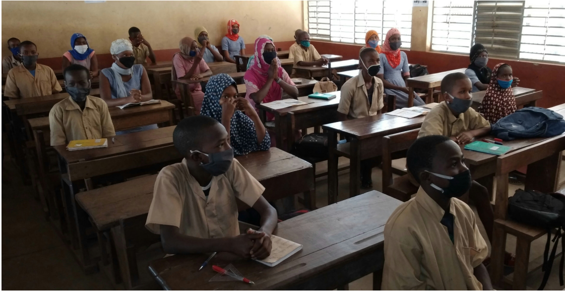
Students at a UNICEF-supported primary school in Mamou wear masks and respect the distance required for a safe reopening of schools.