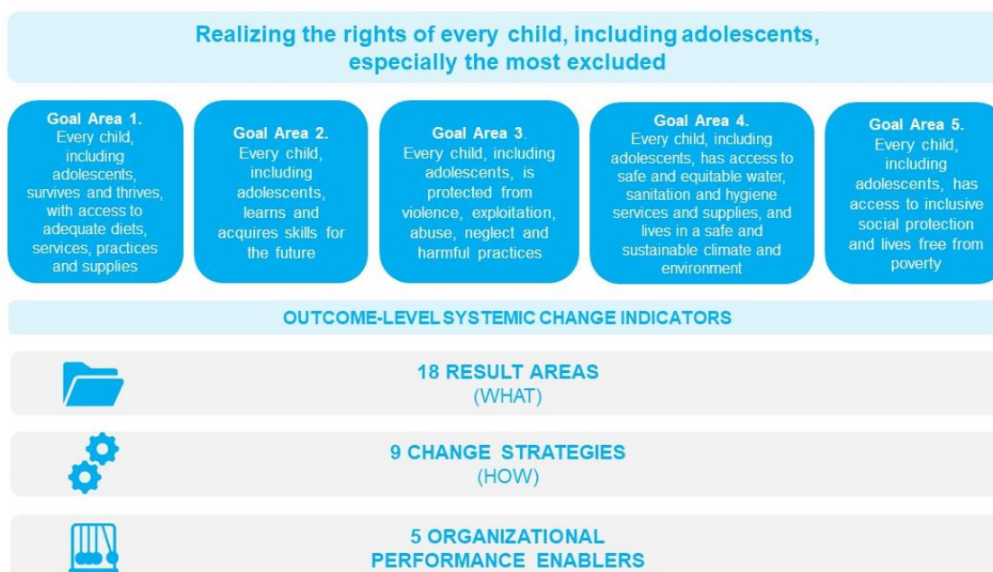
Figure II Strategic Plan results architecture

36. Living through a global crisis has taught UNICEF that it must prepare for the next one now, address the fragility that undermines children’s rights in so much of the world, and continue to meet its commitments to protect children growing up amid humanitarian crises. That means strengthening collaboration, coherence and complementarity across its humanitarian and development programming and its contributions to social cohesion and peace. In a key evolution for UNICEF, the Strategic Plan will not separate out humanitarian action, but will situate it within the pathways to systemic change that have been envisioned. Principled, timely, quality, child-centred humanitarian action not only saves lives and promotes dignity during crisis – it is also critical to building resilient systems, accelerating progress towards achievement of the Sustainable Development Goals and realizing children’s rights. UNICEF is embedding specific programme and operational commitments to implement the Core Commitments for Children in Humanitarian Action, its core policy and framework for humanitarian action, throughout the Strategic Plan.