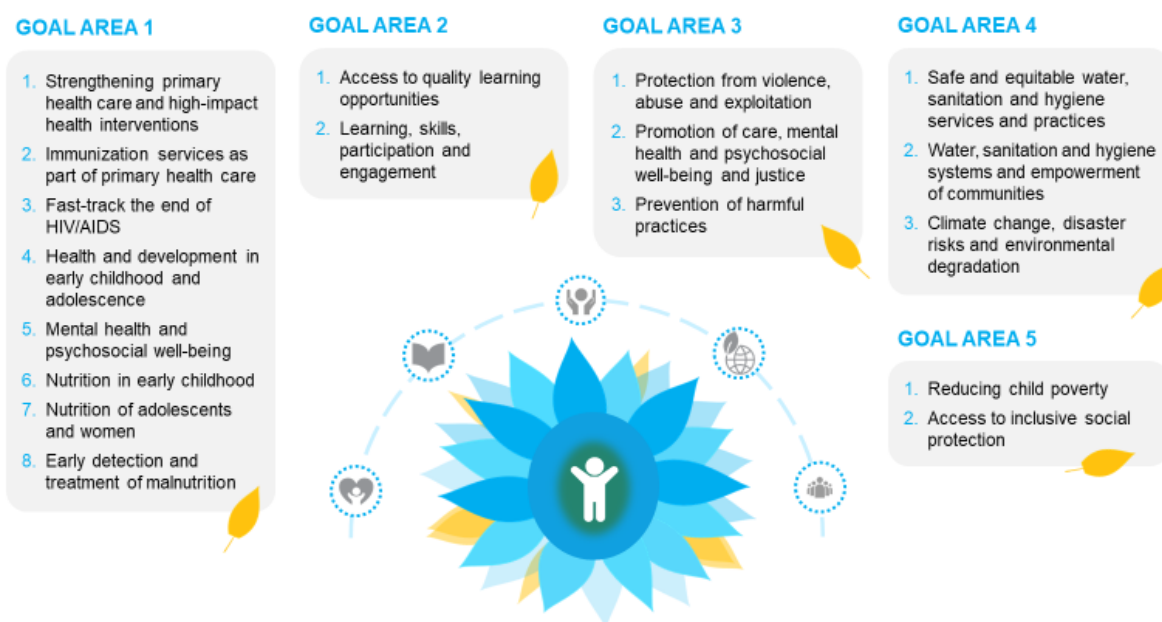
Figure II Result areas of the Strategic Plan, 2022–2025