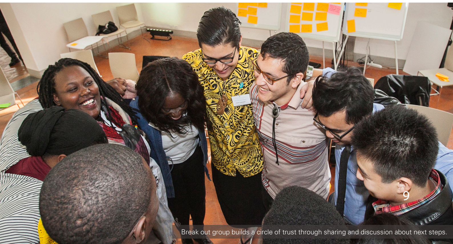
Break out group builds a circle of trust through sharing and discussion about next steps.

This panel session moderated by Wellcome Trust heard from executives and representatives from civil society organizations and foundations, followed by Q&A – Temasek Foundation (Singapore), United for Global Mental Health , FC Barcelona Foundation (Spain) and NCD Child – on the actions they are taking and funding, and their hopes and challenges.