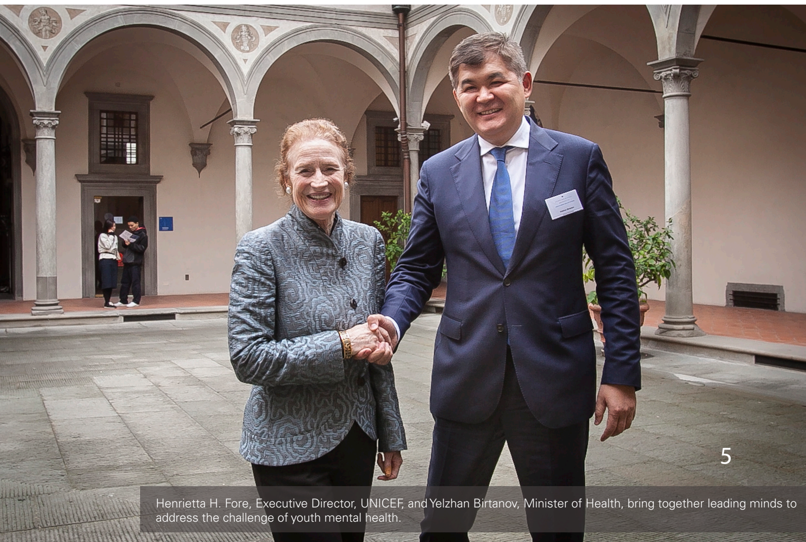
Henrietta H. Fore, Executive Director, UNICEF, and Yelzhan Birtanov, Minister of Health, bring together leading minds to address the challenge of youth mental health.

During the conference, the participants connected with each other, listened and learned from experts and lived experience, shared their interventions and solutions and discussed lessons learned and what works. Finally, they collaborated within peer groups to decide on their actions, what they asked of other peer groups and what they could offer and then begin to outline an agenda for action to accelerate progress. Annexes 1 and 2 cover the Conference Programme and List of Participants, describing the sessions, participants and facilitators.