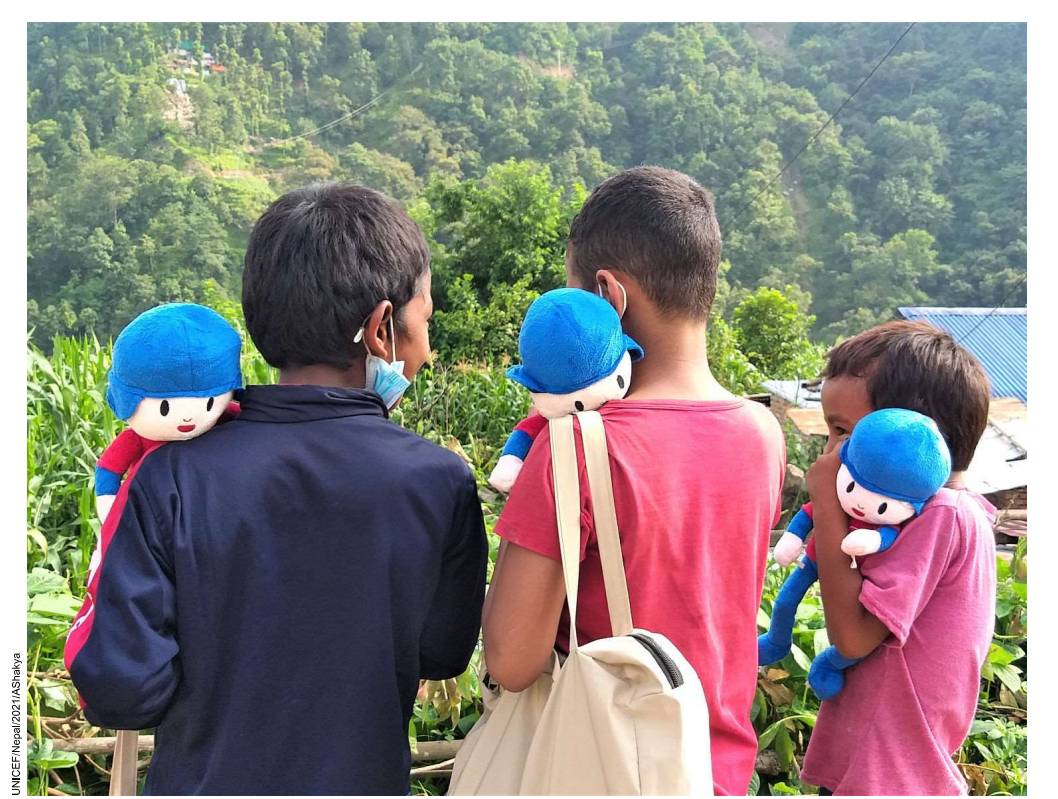
Children affected by floods and landslides in Sindhupalchowk district are given hygiene kits, containing basic sanitation and cleanliness supplies, as well as some recreational materials

Children in a community in Sindhupalchowk District in central Nepal affected by monsoon-induced floods and landslides were provided mental health support by clinical psychologists mobilized with UNICEF support. UNICEF initiated a child and adolescent mental health (CAMH) programme in 2020 in collaboration with the Kanti Children's Hospital to help address psychological issues among children and young people in the wake of the disaster. Under the guidance of the facilitators, the young participants took part in relaxation exercises, stress management techniques and discussions about mental health.