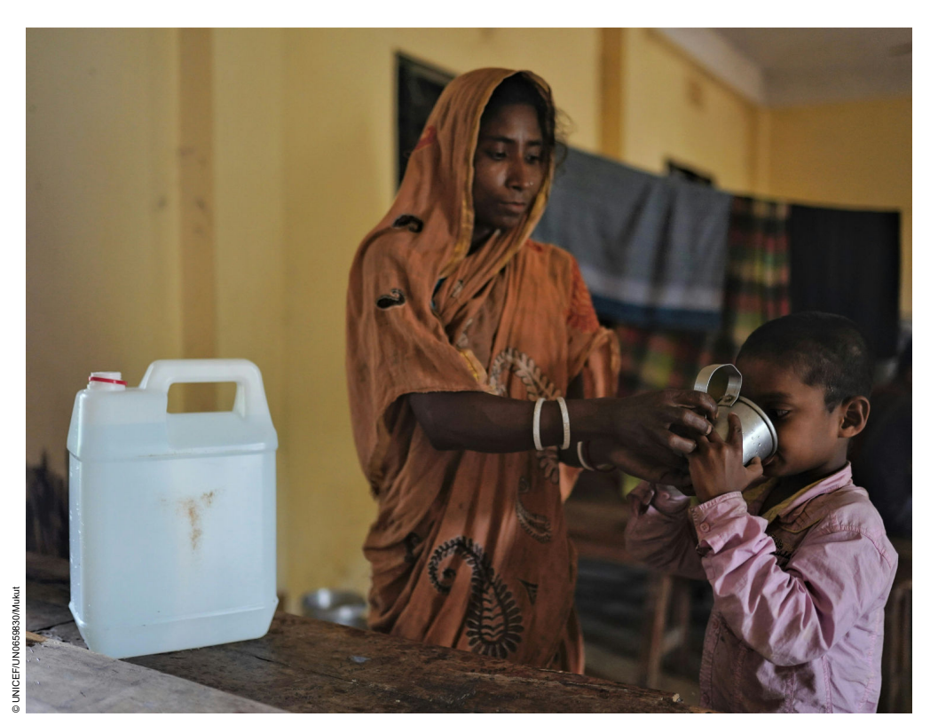
A child takes the first gulp of safe drinking water in days after UNICEF distributed water purification tablets to families in this flood shelter in Sylhet.

The lives of 3.5 million children have been disrupted by floods in north-eastern Bangladesh. Floodwaters have severely damaged almost 106,727 water points and 283,355 sanitation facilities, leaving families with no clean water or toilets. On top of the food shortage, increased risk of drowning, separation from families and violence, children are at increased risk of waterborne diseases. Since the floods started, UNICEF has delivered water purification tablets, water containers, dignity kits, and therapeutic milk. But the impact of the flood will be felt for a long time to come and the need for clean water and sanitation remains high.