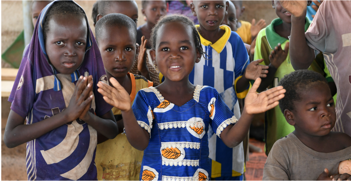
Frank Depaign photo ID: UNICEF/2387