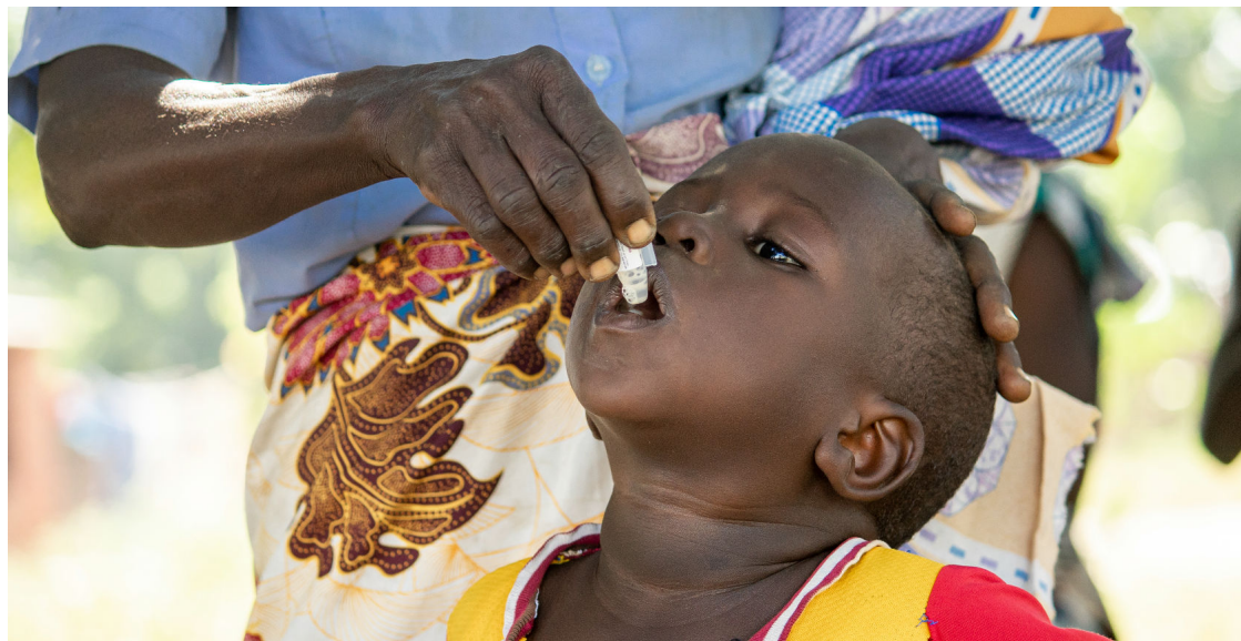
A child receiving the cholera vaccine in Chikwawa district during the cholera vaccination campaign in May 2022. UNICEF supported Ministry of Health by delivering 2.9 million doses of OCV.