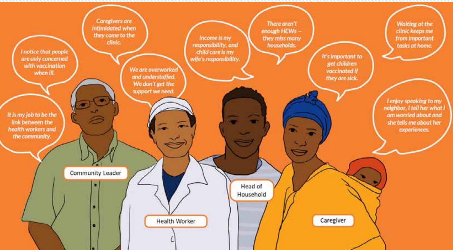
Figure 3: Community insights generated through rapid inquiry

Emerging findings have therefore been relevant to their specific community, which in turn has improved trust, interest, and engagement in addressing the barriers to the issues concerned. Figure 3 shows community insights from the HCD process, while Table 1 summarizes some of the ways in which communities where HCD has been applied have been engaged to date.