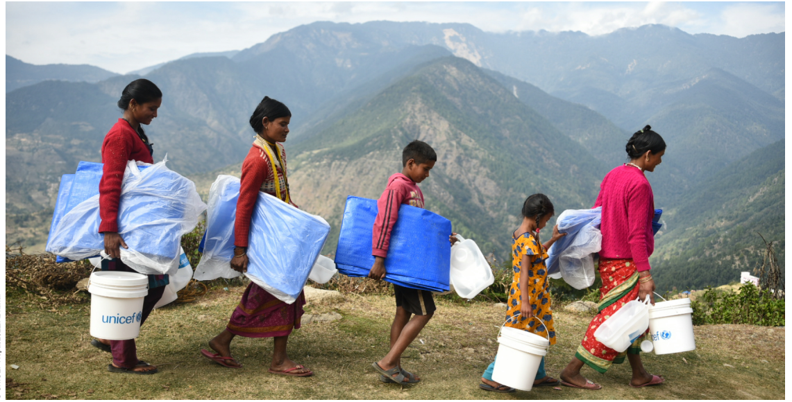
Children and families in an earthquake-affected community in Doti District in far western Nepal walk with blankets, tarpaulins, water containers and chlorine solution provided through UNICEF support. Nepal is located in an active seismic zone and is prone to megaearthquakes.