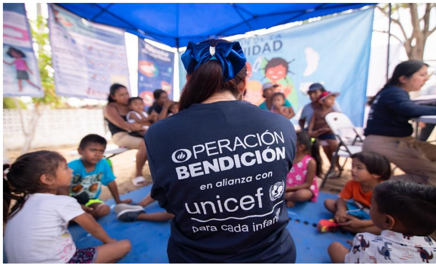
Photo: Actividades in "El Rincón de la Dignidad" in El Mogote, Coyuca de Benítez, where children and their families can find, with a SBC-AAP-Gender strategy, personal hygiene products and learn about the importance of proper hygiene. © UNICEF Mexico - Silvia Carranza Reporting period: 20 December – 1 February 2024