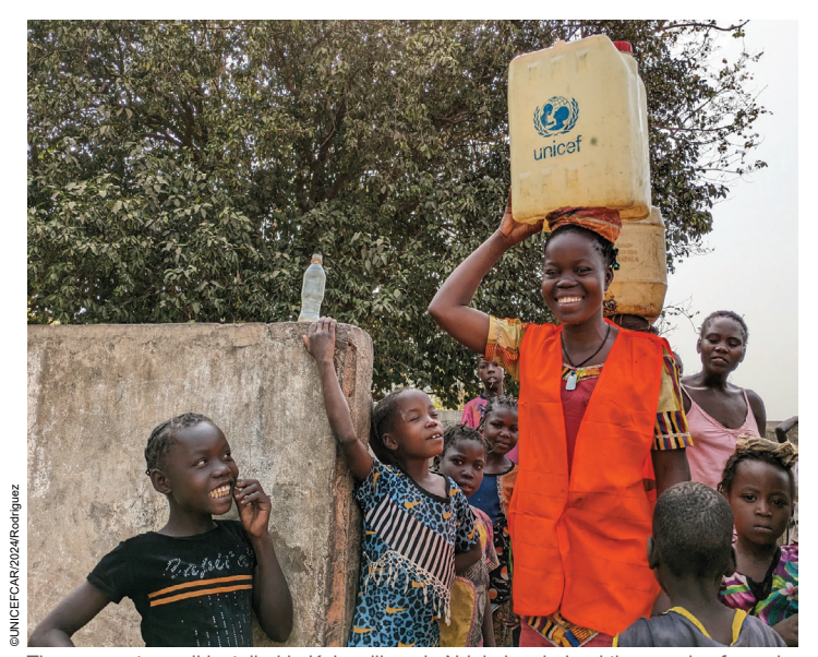
The new water well installed in Kaka village in Ndele has helped thousands of people gain access to clear water.

During this period, teacher training initiatives, which had been postponed, commenced, resulting in the training of 160 teachers (10 female and 150 male). Furthermore, UNICEF conducted sensitization campaigns on the importance of education, reaching 3,667 community members (1,968 female and 1,699 male). Additionally, UNICEF, in collaboration with partners, completed the construction of 36 classrooms in Haute-Kotto and Ouaka.