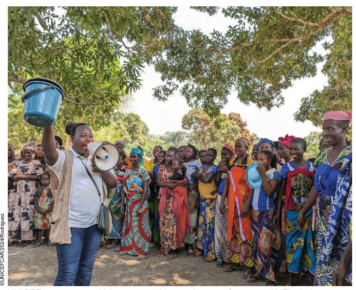
UNICEF partners sensitizing communities on the use of water and NFIs during a distribution in Damara.

During the reporting period, UNICEF assisted the humanitarian community in conducting a dissemination campaign for the Humanitarian Needs Overview (HNO) 2023 and the Humanitarian Response Plan (HRP) 2024 in Bria, Bambari and Kagabandoro. The campaign aims to improve transparency on the humanitarian planning including targeting criteria.