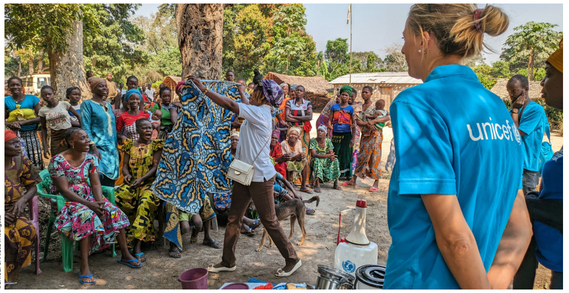
UNICEF partner presenting the content of the NFI & hygiene kits to displaced people in Ngoukpe and Oumba in the Ombella-M'Poko Prefecture