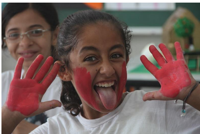
Drawing class at adolescent summer activities in Gaza during the school break