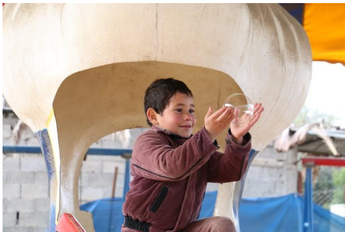
Child playing in a Family Center in Gaza