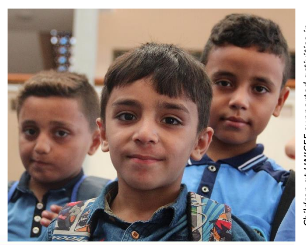
Children at UNICEF supported activities in Gaza