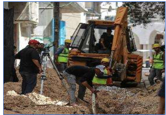
Water network being upgraded in Khan Younis. UNICEF 2018

UNICEF and partners are currently working to assess all the communities that are unconnected to a water network in the Hebron governorate, and unserved in terms of water supply (around 818 households in 51 communities with a total of 5,811 people) in order to improve the quality of water consumed, identify households practicing open defecation and support them with dedicated interventions and behavioural change activities. This intervention includes: i) the installation of innovative household water treatment and safe storage (HWTS) units, based on gravity driven membrane (GDM) in 30 households, in 7 clinics for healthcare services and in 13 primary schools of the area; technology adaptation to users and facilities; regular monitoring activity, data collection and analysis, establishment of water quality lab in the area and lab personnel training; ii) Assessment of the WASH conditions of communities unconnected to a water network in Hebron governorate; the application of the Risks, Attitudes, Norms, Abilities, and Self-regulation (RANAS) approach; the identification of barriers and of possible response; and iii) Promotion of hygiene practices as well as the design of sessions on the use and safe consumption of water.