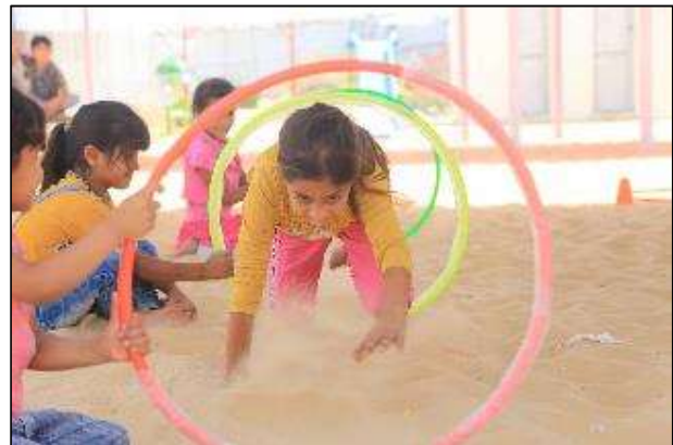
Psychosocial support group activities in family centres in Gaza.

In response to the upsurge of violence and needs, child protection and mental health and psychosocial (MHPSS) actors have coordinated their response through the Child Protection coordination group. This has allowed for a stronger coordinated response to children injured and their caregivers affected by the violence at the fence, notably by the provision of MHPSS services.