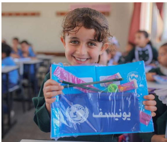
Girl smiling when received stationary items in Gaza Gaza Strip