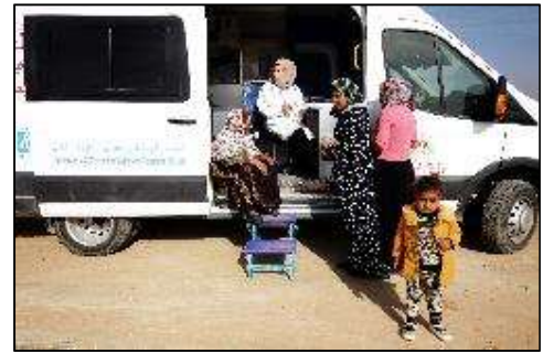
Health care delivered through the mobile clinic in Bedouin community in Yatta Area. UNICEF 2018

UNICEF procured a total of 509 pallets of essential drugs, delivered to MOH, covering the needs of 235,653 high risk pregnant and lactating women, newborns and young children. UNICEF also organized three Nutrition Sub-Cluster Working Group (NWG) meetings to finalize the contingency response plan, as part of the continuous efforts to strengthen the coordination and cooperation amongst nutrition partners. In coordination with Save the Children and WFP a joint nutrition needs assessment will be conducted for children and women in early October with technical assistance from the Global Nutrition Cluster. UNICEF conducted training on the Rota-vaccine switch for approximately 710 doctors and nurses from MOH and UNRWA in the West Bank, while another 300 in Gaza, benefited from the training.