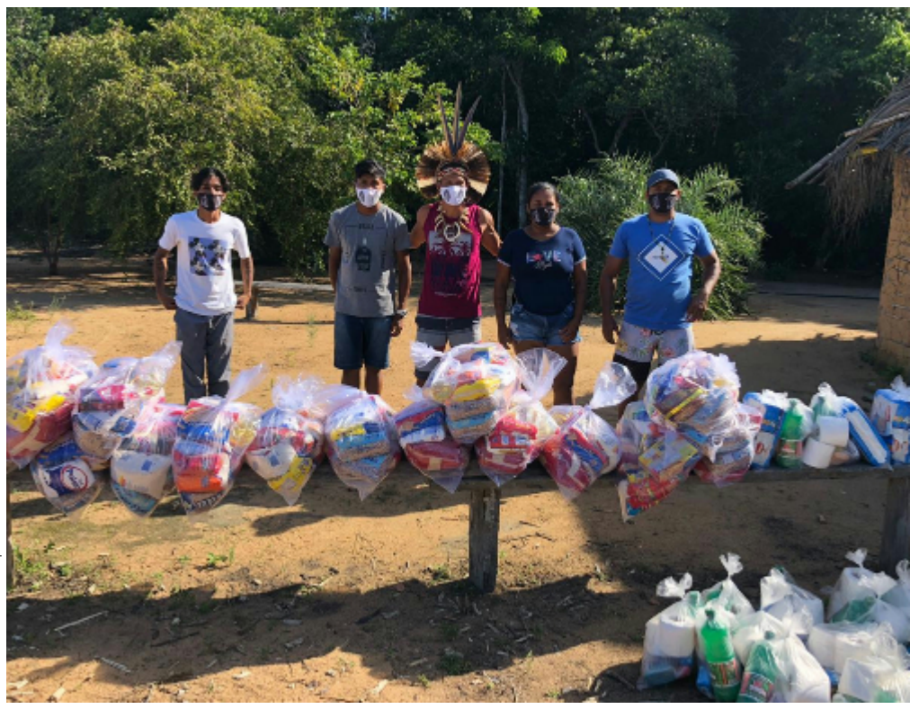
Young indigenous people from different parts of Brazil are working to bring COVID-19 information to their communities and raise funds for needed food and hygiene supplies with UNICEF support.

COVID-19 has aggravated pre-existing inequalities in Brazil and increased their negative impacts on the most vulnerable people, particularly indigenous communities.