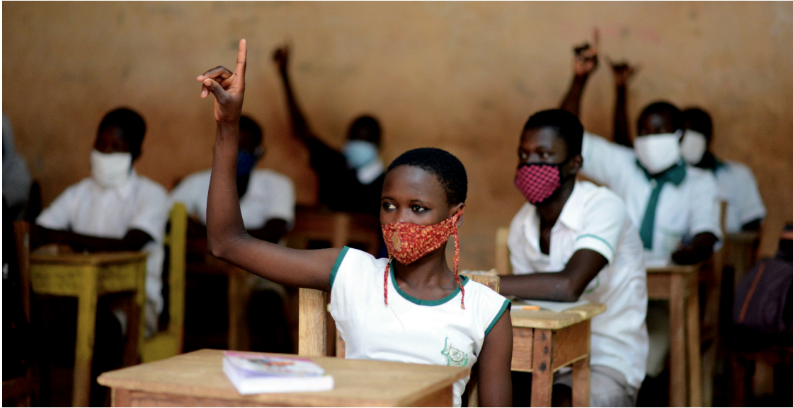
Students wear masks to prevent the spread of COVID-19 at a UNICEF-supported junior high school in Nyankpala, Northern Region. They are preparing to take the Basic Education Certificate Exam.