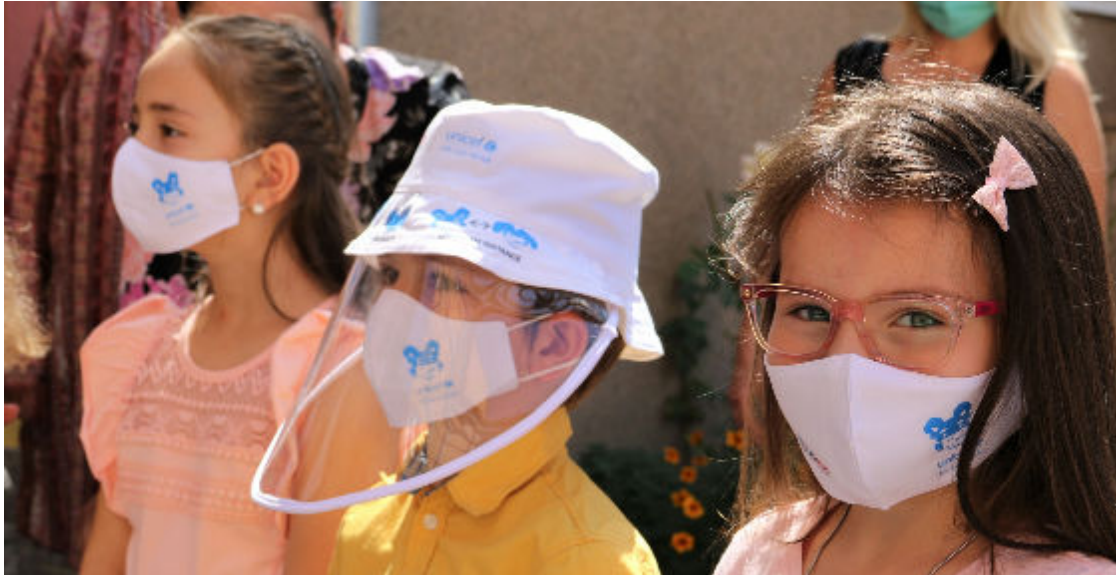
Grade 1 children returning to the Naim Frashëri Primary School in Pristina, Kosovo, receive hygiene kits as part of the #Back2School campaign to benefit students and teachers.