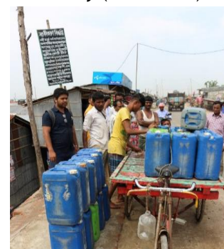
Picture 1: Water distribution and sale by Water Vendors in a Dhaka LIC

dramatically different: access to basic water sources drops to only 18 per cent for dwellers in LICs in Bangladesh, and while the national average for access to basic (improved) sanitation