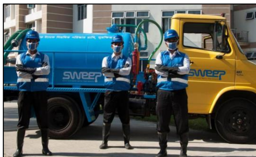
Picture 6: Faecal sludge emptying service, Dhaka

for faecal sludge management 7 . The framework puts the overall responsibility for execution of the entire FSM chain under Dhaka's City Corporation (though it will require collaboration with DWASA for possible treatment and re-use elements of the FSM chain).