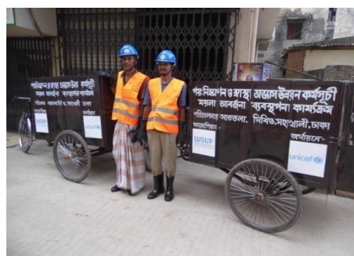
Picture 3: Solid Waste Management by Local Entrepreneurs in Dhaka LICs

Although this has yet to see significant scale, UNICEF has implemented pilot schemes for SWM in collaboration with NGOs. Efforts have been made at establishing a business model for SWM involving local private entrepreneurs and the residents of LICs. The process involved identification and selection of local entrepreneurs, as well as the provision of personal protective equipment, waste collection and transportation equipment, to the identified entrepreneurs to serve as set up materials.