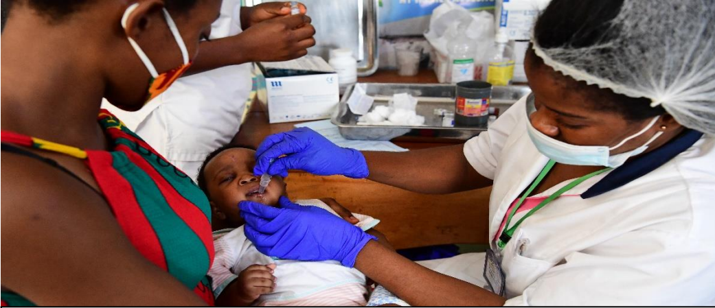
A baby being vaccinated in Buéa, in the South-West region of Cameroon.